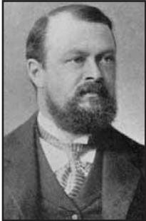
Charles Melville Hays

Saskatchewan's smallest city, with a population of about 4,600, Melville is an agriculture service centre with a strong railway history. It is named after Charles Melville Hays, president of the Grand Trunk Railway, who perished in the sinking of the Titanic on April 15, 1912. The city is on Canadian National's east-west and north-south lines and the railroad is still one of Melville's major employers, employing several hundred local and district residents.